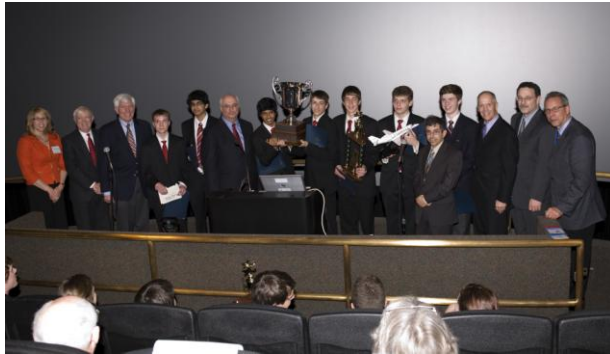
Xavier High school Team-2011 National Winner

The Real World Design Challenge is an annual high school competition run by a public-private partnership with the goal of sustainably increasing the Science, Technology, Engineering, and Mathematics (STEM) workforce. Teams of 3-7 secondary school students design a plane looking at the forces of flight, lift, weight, thrust & drag with the goal of enhancing performance and fuel efficiency. Each team is supported by professional mentors.